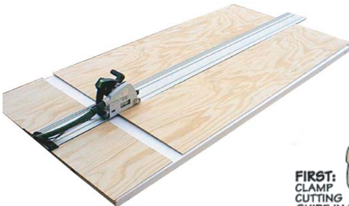
Rip cut using a commercial guide