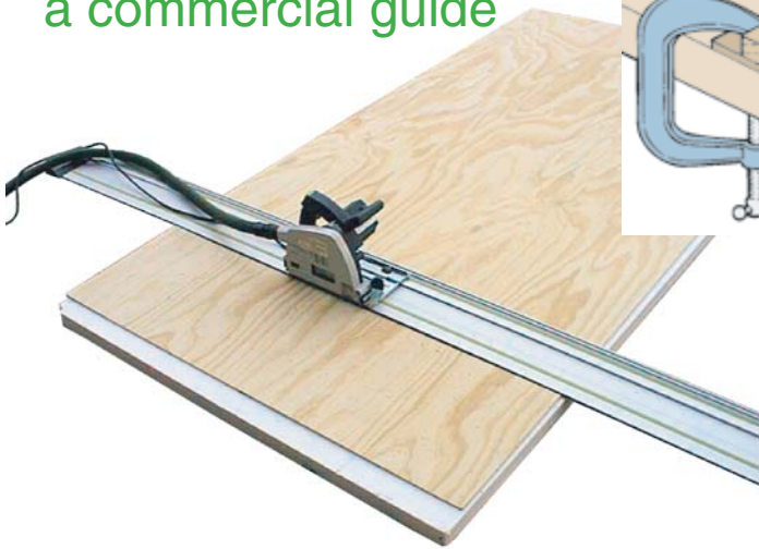
Crosscutting using a commercial guide